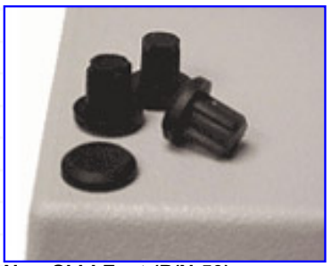
Non-Skid Feet (P/N 50) RETURN TO TOP