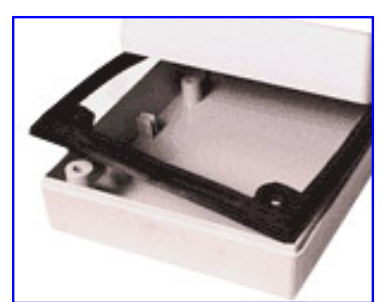
Perimeter Seal (P/N PS-15)